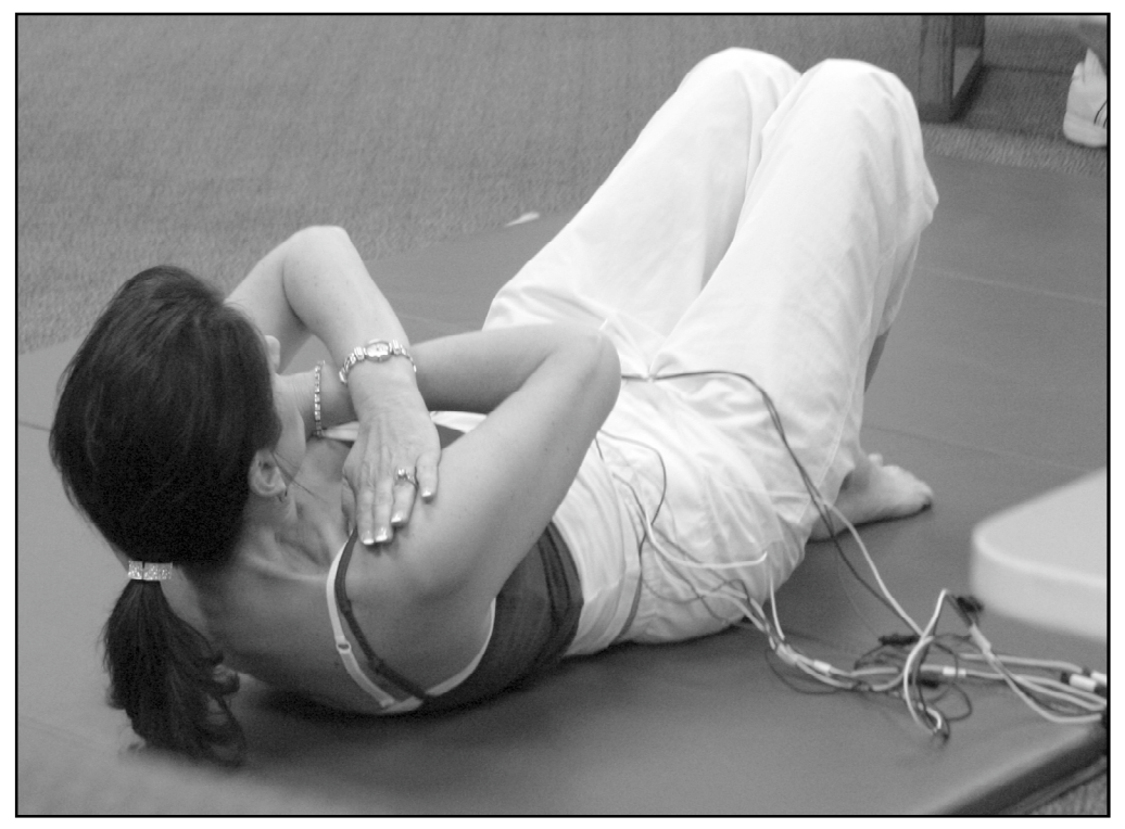
Figure 1. Subject performing abdominal crunch

malized as a percent of the muscle's maximum EMG during a maximum strength measurement, the EMG is a reliable tool to measure muscle use.<sup>16,17</sup>